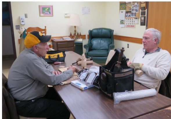
Some of the gang working .... And/or talking