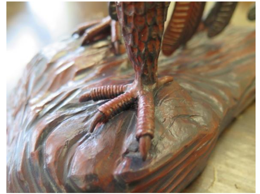
Close up of Rooster's Feet